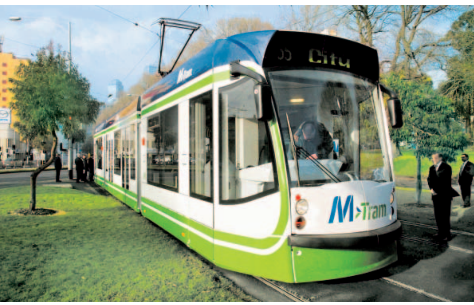
Combino® five-section, articulated low-floor tramcar built by Siemens AG, Transportation Systems – Light Rail, Germany

Examples of Application Engineering Publ. No. WL 07 536 EA